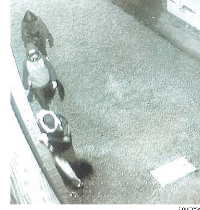
The suspects are shown in an image captured from a surveillance video.

Officials were able to recover some calculators and a fire extinguisher that were left behind.